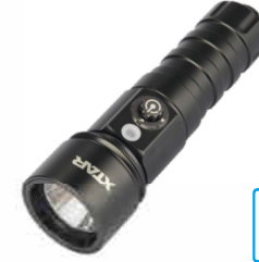
Whale D26 1000 (Warm Light) LED Diving Flashlight