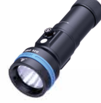
D26 2500 (Short Type) Longer Burn time Dive light for Deeper Sea