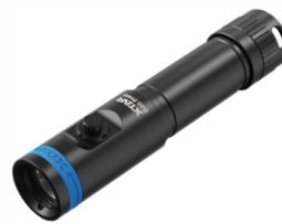
D20 Press 1200 MiniSuper Compact Light, Diving Might