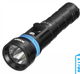
DL2 1600 2-in-1 White Beam & Green Laser