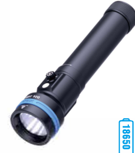
D26 2500 (Long Type) Longer Burn time Dive light for Deeper Sea