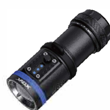
D30 4000 Multiple lighting colors for underwater photography