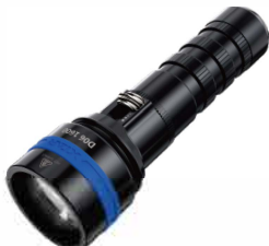
D06 1600 Diving Flashlight