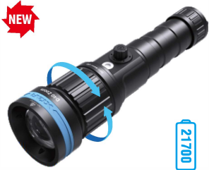
D40 ZOOM One Light for All Dives!