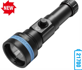
D26 2800 Your trusted partner for diving.