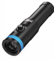
DL1 Pointer Lead The Way Clearly