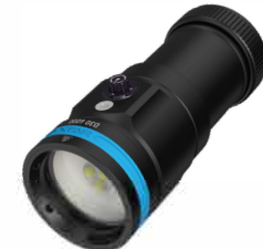
D30 6000 Extra-wide beam dive light for underwater photography