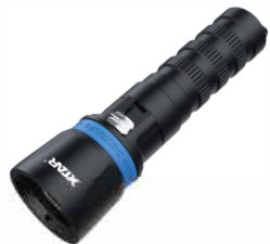
DS1 1000 Magnetic Slide Switch Diving Flashlight