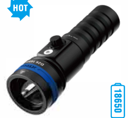
D26 1600S Magnetic Press Switch Diving Flashlight