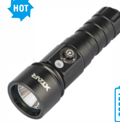
Whale D26 1100 LED Diving Flashlight