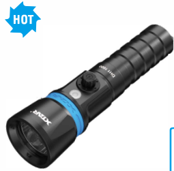
DH1 1600 Hunter Dive Boldly, Hunt Brightly