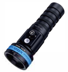
D30 1600 Multiple lighting colors for underwater photography